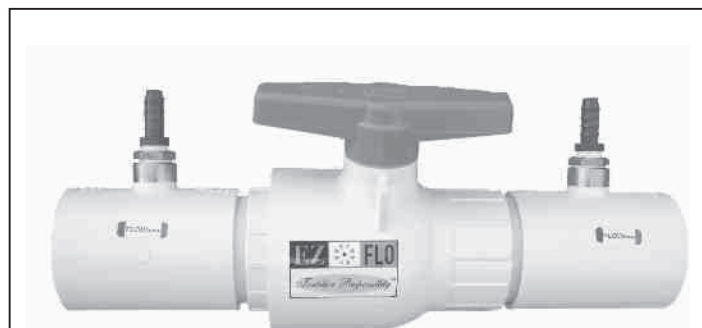
HI-FLO Ball Valve Coupling

Manifold connections are available to connect two or more storage tanks to one connection in the irrigation line. These connections are made of 1/2" braided chemical tubing.